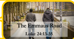
The Emmaus Road Luke 24:13-35